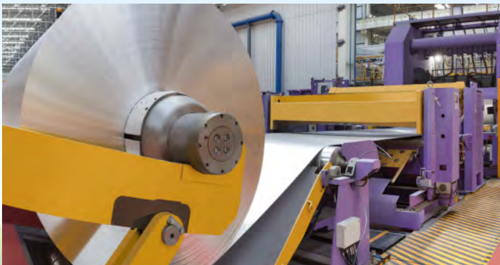
Twin roll casting line JUMBO 3CM ®

Novelis PAE doesn't just supply casthouse equipment! Achieving customer total satisfaction means that we offer a wide range of complementary industrial services including technical support and sale of spare parts and consumables.