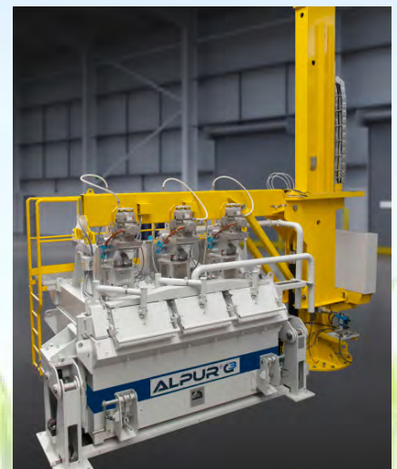
Degassing unit ALPUR ® G3-3R